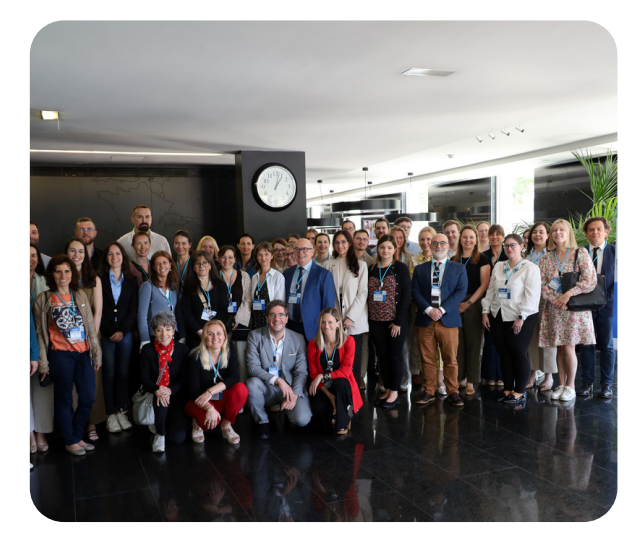
Dates: 19/21 June 2024 Location: Lisbon, Portugal